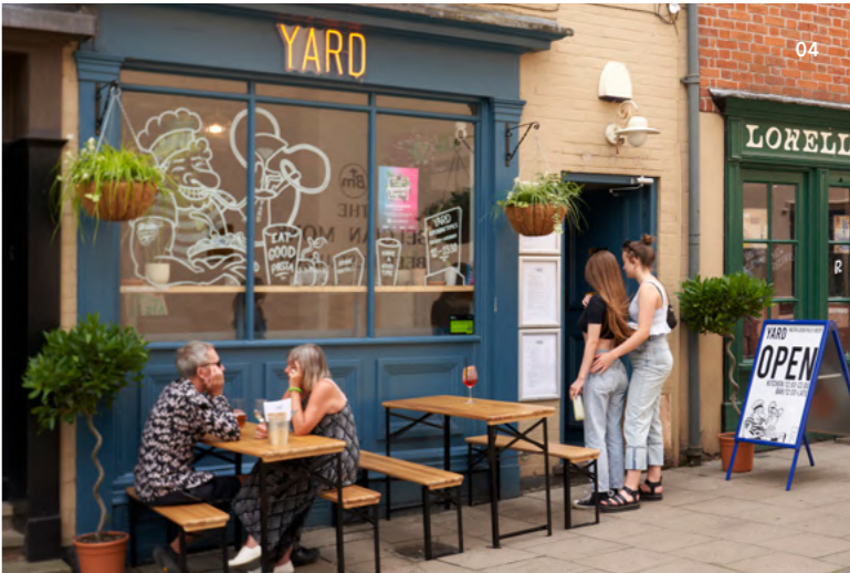
01 City paddleboarding 02 Colorifix 03 Fuel Studios 04 Yard

Norwich could be the next place you call home. Are you ready to discover the everyday wins working in Norwich can bring?