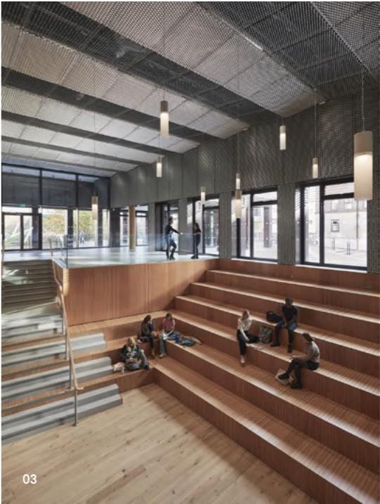
01 UEA chemistry 02 UEA students 03 NUA, Duke Street 04 Sainsbury Centre for Visual Arts